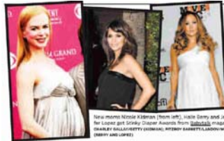
Halle Berry and Jennifer Lopez get Stinky Diaper Awards from babytalk magazine.